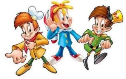
When "Snap, Crackle and Pop"were sounds that came from my Cereal, not my body!